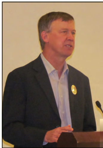
Governor John Hickenlooper addresses commissioners and other county officials during the CCI Summer Conference.

Over three hundred county commissioners, councilmembers and county staff were in attendance for Governor John Hickenlooper's opening remarks at CCI's 2011 summer conference.