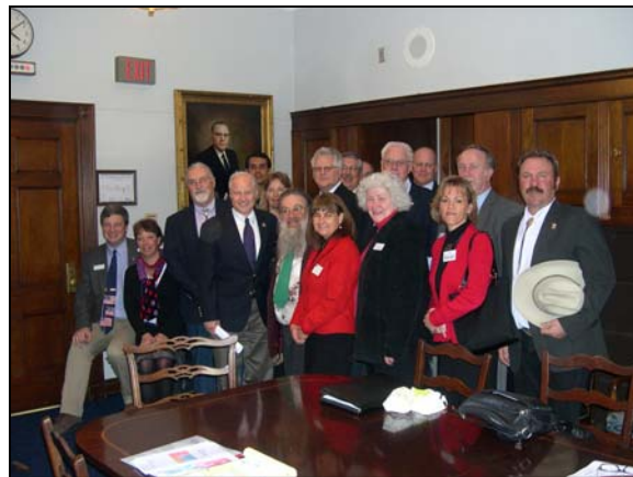
A large group of commissioners met with Representative Mike Coffman while in Washington D.C.