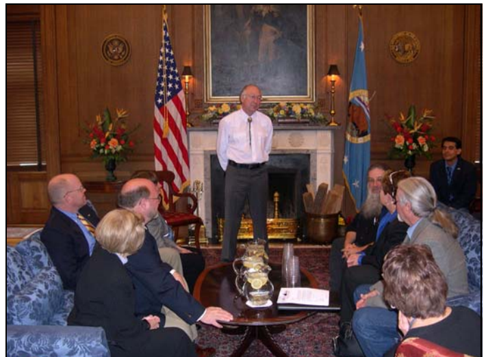
Secretary of the Interior Ken Salazar listens to a question posed by a commissioner at his office in Washington D.C. A number of county commissioners were able to meet with Secretary Salazar.