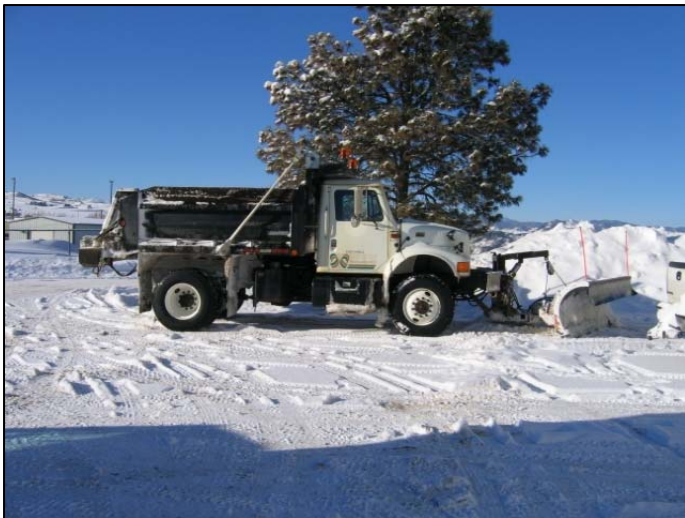
Douglas County snowplow donated to Costilla County.

As part of the Counties Helping Counties program, Douglas and Costilla County created a plan for the joint, mutually beneficial exchange of assets.