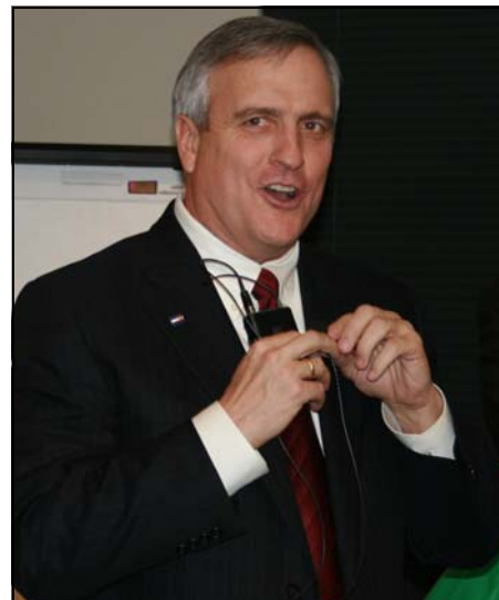
Governor Bill Ritter took time from his busy schedule to talk with commissioners and general assembly members at the CCI Legislative Reception.