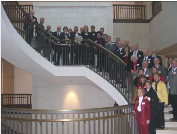
More than 40 county commissioners attended the NACo conference in Washington D.C. Here some of those commissioners and other county staff members are pictured during a visit to the Capitol to meet with the Colorado congressional delegation.

About twenty county commissioners and councilmembers also met with newly appointed Secretary of the Interior, Ken Salazar. Secretary Salazar graciously welcomed his friends from back home to his office, gave a tour of his "new digs" and shared his views on the Department's new direction.