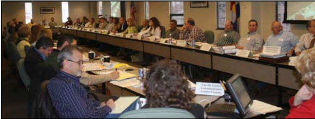
More than 50 commissioners gathered at CCI for New Commissioner Orientation which took place January 7-9.